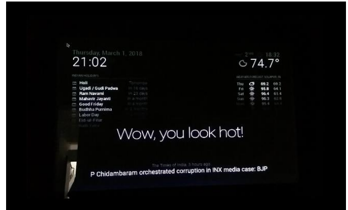
Fig 5: Output of Smart Mirror