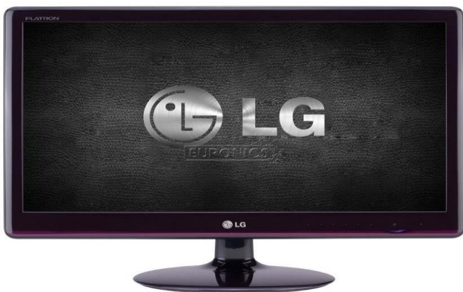
Fig 1: LED Monitor

Their brightness allows them to be used outdoors where they are visible in the sun store signs and billboards, and in recent years they have also become commonly used in destination signs on public transport vehicles, as well as variable-message signs on Highways.